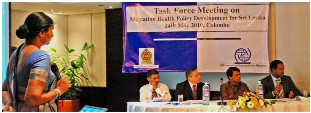
Image: National Taskforce Meeting for Migration Health Policy Development for Sri Lanka