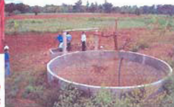
An agro well for the farming communities