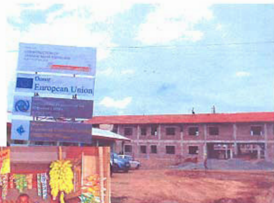
Construction of a large school in Batticaloa

Supporting development and rehabilitation of large/small scale infrastructure including community and public service providing entities; Provision of reintegration services to vulnerable groups (ex-combatants and related vulnerable family members, IDPs, Refugee Returnees, Youth associated with conflict) through livelihood development and capacity development activities and; Provision of early recovery support for livelihoods development including: training and capacity-building programmes; support to micro-enterprise development; engaging beneficiaries as labour providers and; provision of tools and equipment.