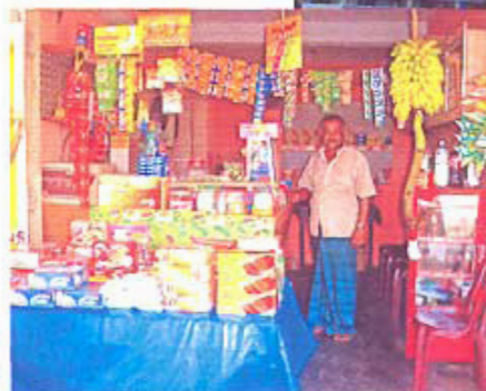
An IOM livelihood beneficiary in front of his grocery store